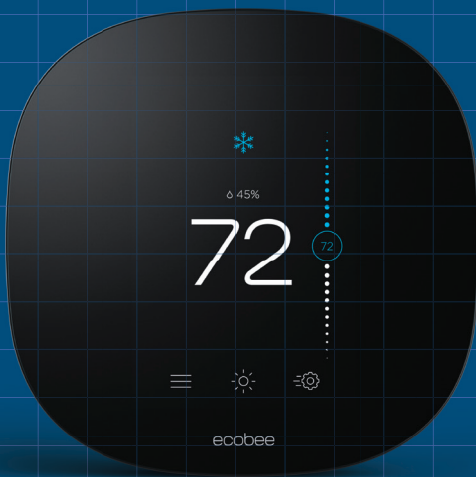
Ecobee 3 REM# 4CS3951

Simple integration and compatibility with any smart home system.