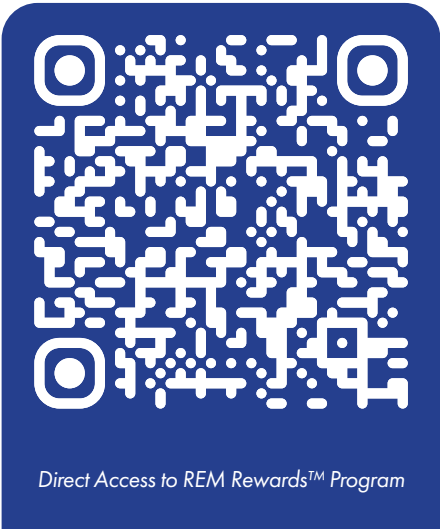
Direct Access to REM Rewards™ Program